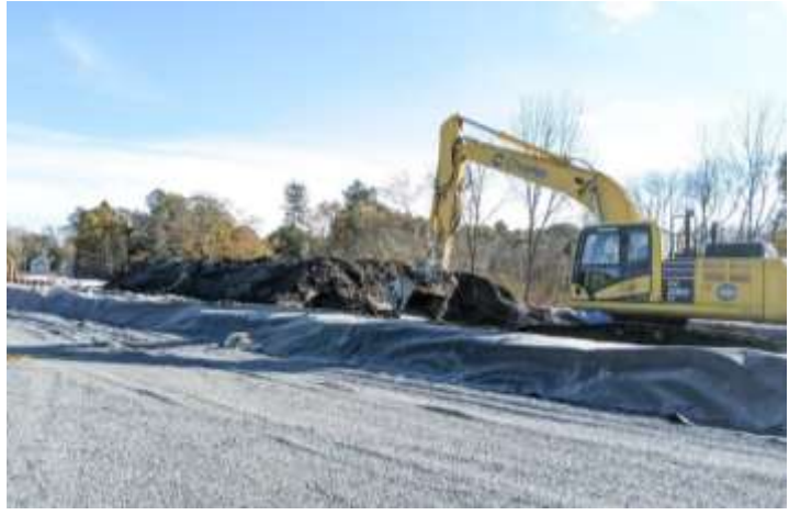
Dewatering Excavated Soils

How long will the cleanup project take? Construction began in August 2020 and is expected to take an estimated eleven months to complete. This schedule depends on a number of factors, including weather conditions. Once this work is completed, impacted areas will be restored. Vegetation will be planted, and other wetland mitigation efforts will be employed to restore these resource areas as close as possible to a pre-construction condition.