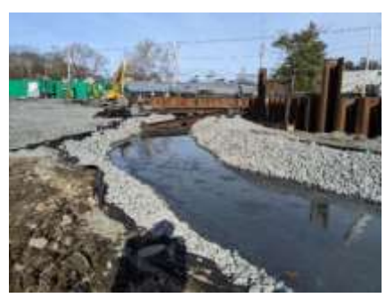
Mire Brook Temporary Bypass