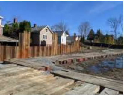
Support Mats Positioned for Accessing Excavation Area